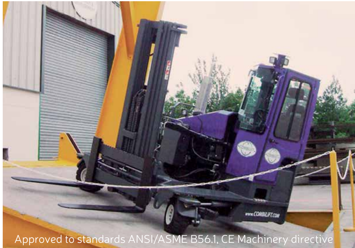
Approved to standards ANSI/ASME B56.1, CE Machinery directive

the acknowledged leading manufacturer and innovator in its sector worldwide