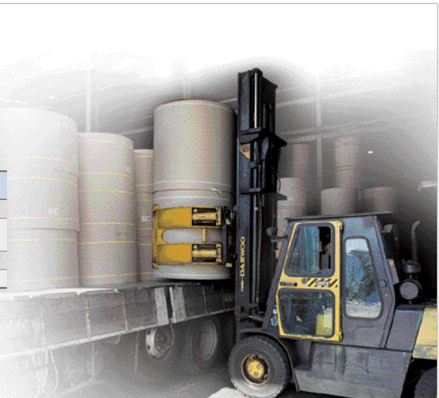
PAPER ROLL CLAMP