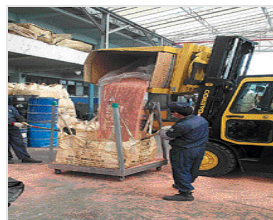
Bulk Box Handler