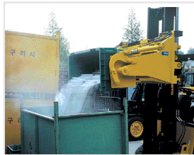
Tipping Drum Clamp

Products below are available also. Consult us for details and any other products.