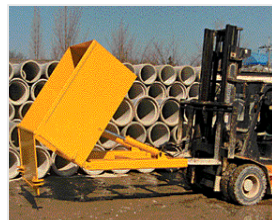
Forward Dump Bucket