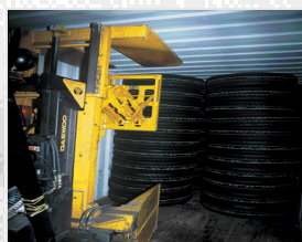
Tire Push Clamp