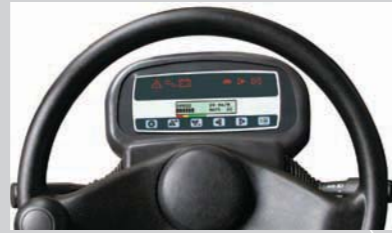
New Multi-Display employed full dotted LCD is located on the steering column to improve visibility and manipulate-ability.

DANAHER MOTION made high-frequency controller incorporates a powerful microprocessor together with MOSFET power electronics.