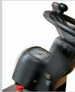
The adjustable steering Column ensure a comfortable working position.